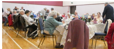
Some of the seniors, enjoying the event.