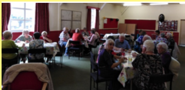
Some of the happy eaters