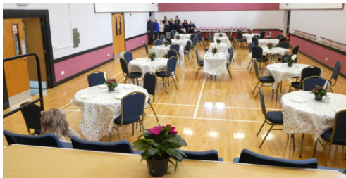
The room, ready and waiting for the hungry seniors of Barton.

The previous tea party was a rescheduled Christmas party, which the seniors enjoyed, as an event away from Christmas, so Barton Lions decided to hold one in April, and another this coming October.