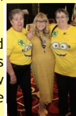
DG and her Minions