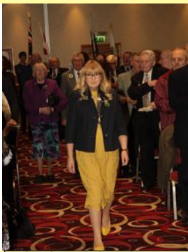
And so it begins....

This morning I entered this room to the sound of Coldplay playing 'Adventure of a lifetime'.....the title seems apt, that and the fact that I was form tutor and biology teacher to the lead base guitar player. I know what you are thinking; it would have been far more impressive if I said that I taught him to play the guitar!!