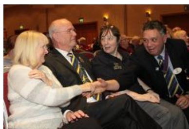
BS + BN