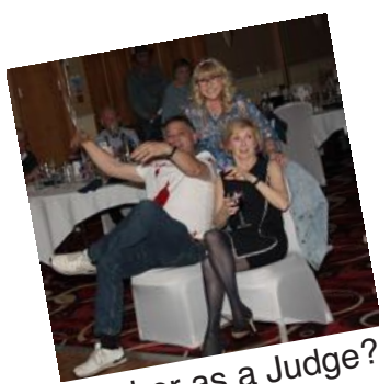
Sober as a Judge?