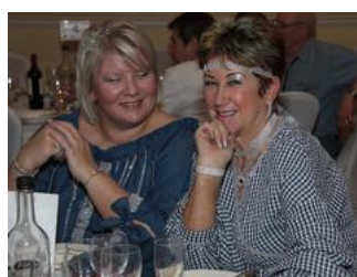
Little Orme Sparklers