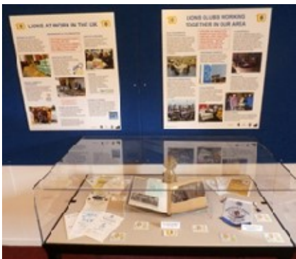
Part of Exhibition