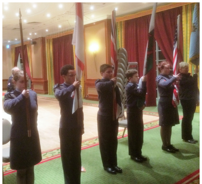
The ATC 235 Squadron, City of Stoke on Trent – hoping to get it right on the day.