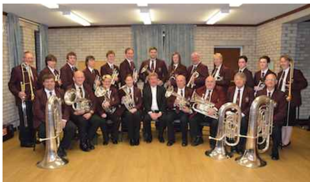
Farndon & District Brass Band

Our Easter Egg Raffles and the Brass Band in Concert in April helped to boost our Charity Pot. Some of the monies from these events went towards funding the donation that was made to 1st Helsby Scouts who are taking part in the Jamboree in Bodø, Norway in the Arctic Circle later this year. The day that we made the presentation they were busy making night-masks so they could sleep in the permanent sunlight!