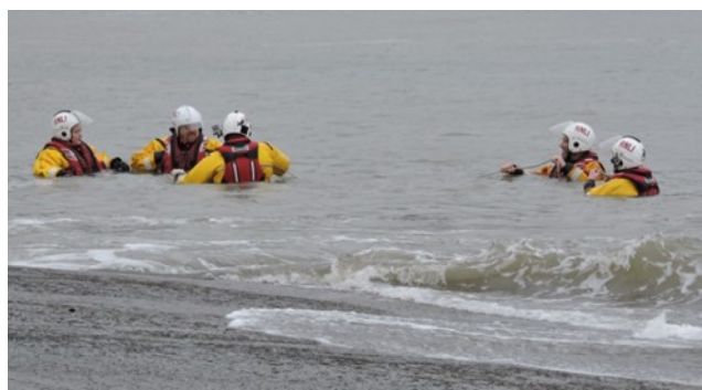
The safety cordon of RNLB in the water.