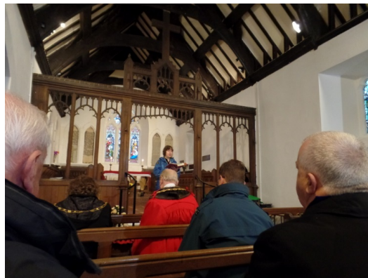
Inside St. Tudno's Church