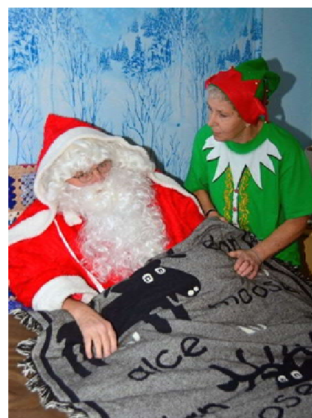
Santa climbs wearily into bed, assisted by his Elf.

"In addition to our Friends we are also grateful to the local media who publish the dates and routes of our rounds with Santa and his sleigh in advance of our coming. But our biggest thanks have to go to the people of South Telford who year on year await our arrival and come out to meet us with contributions of money and food. This year in particular we were told by many that they had written the dates in their diaries so that they could make sure they didn't miss us. It's fantastic and we thank them all."