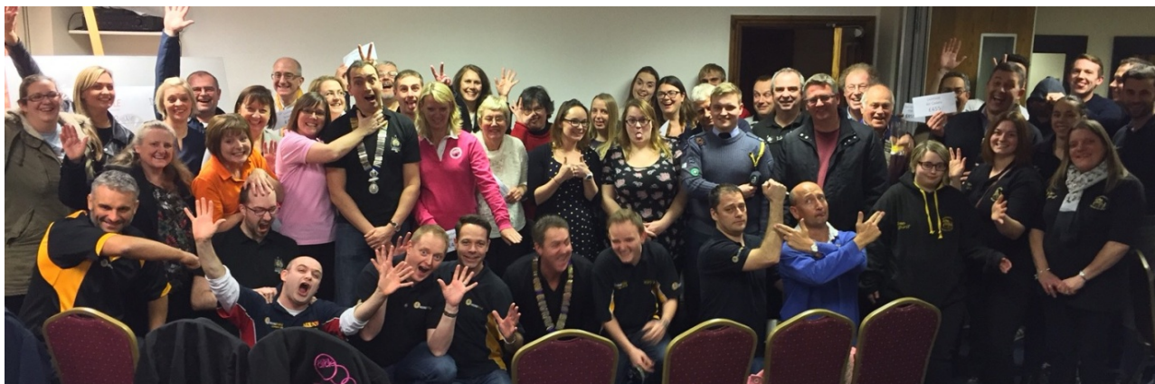
Lichfield Round Tablers and representatives of the organisations who took part.

We all found the evening extremely hard work, but our cut of the £14,005 raised by Lichfield Round Table and about 18 other organisations in and around Lichfield, made it all worthwhile. Will we do it next year? That will depend if the blisters have healed and the memories become softened with time. Thanks also to the 2 helpers from Barton u Needwood Branch Club, who will be sharing our £455 cut of the takings. One thing that we all agreed on, was that the co-operation between Lions and Round Table was extremely beneficial to all of us.