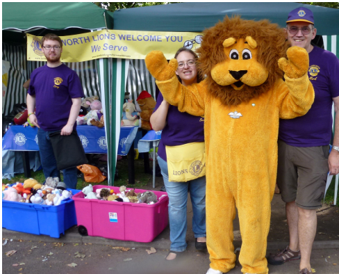
The Lion of Tamworth, welcoming everyone to the event

In August, Tamworth Lions, in partnership with Tamworth Borough Council, held their annual 'We Love Tamworth' day. This is the third such event that Tamworth Lions have participated in, and the event goes back around 20 years when the club used to run the annual Carnival and procession in Tamworth.