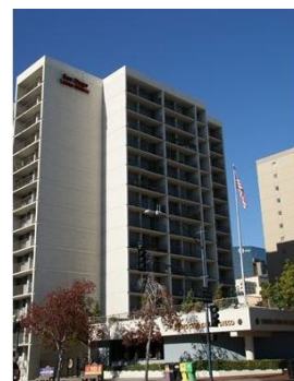
The downtown San Diego Lions Club building

Needless to say, travelling Lions points have been applied for by Tamworth Lions!