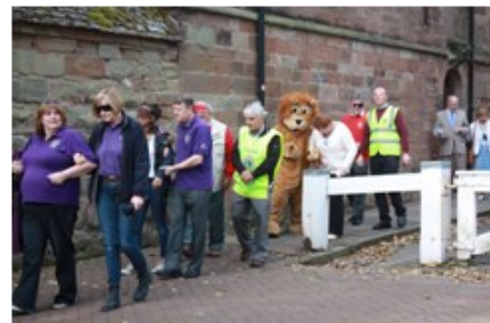
Picture shows The Lichfield Lion assisting fellow walkers navigate what most sighted people would regard as being a safe and straightforward stretch of walkway

The blind told of their problems, but there were also six pairs of glasses to simulate the six main causes of sight loss. Some were scary; everyone that experienced wearing them got the message loud and clear!