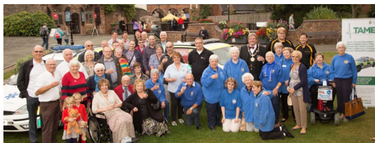
All of the service groups raising a glass to completion of the project on the lawns of Tamworth Castle.

Tamworth Lions, along with all of the service clubs of Tamworth, (Sorooptimists, Rotary and Round Table) where approached three years ago by T.A.M.E./C.F.R. (Tamworth Area Medical Emergency / Community First Responders) with a challenge to provide the Tamworth area with a new first response car.