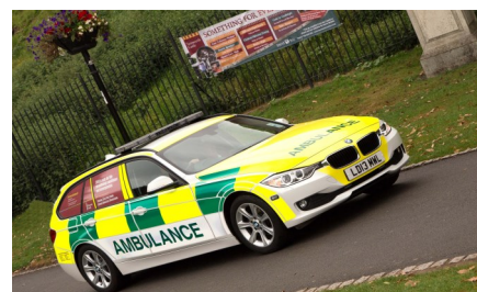
The new ambulance car, in action, fully equipped and able to deal with local medical emergencies.