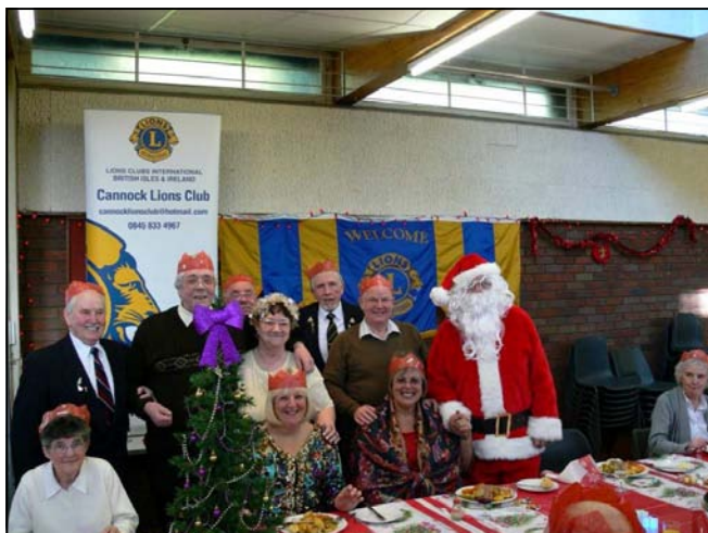
Cannock Lions Club invited some local Senior