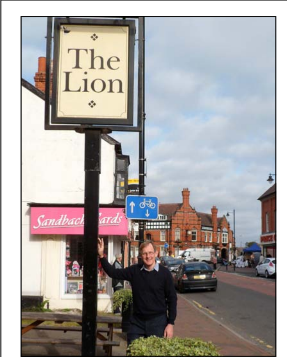
Caption suggestions welcomed