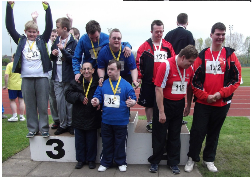
Pictured above left - some of the Lions volunteers from Uttoxeter and Cheadle. Above right another track race gets under way and lower right - teams celebrate at the medal presentation ceremony.