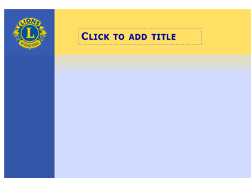
Blank Slide B

Editors Note If any user experiences any significant problems or difficulty using all the features built into the templates please feel free to contact me for help and assistance.