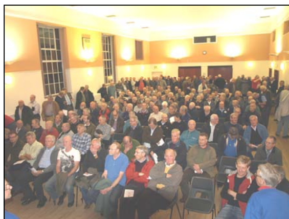
The packed Castle Hall.

Bridgnorth Lions raised the £9,000 necessary just to run the test by a series of fund raising events, plus the support of several local firms and individuals. At the event – for which no charge was made – most men attending also made donations. The total cost for this number of men is over £10,000 and the Lions Club would welcome any sponsorship / donations so that the event can be run on an annual basis.