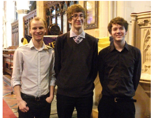
Above runners up with winner from Romiley & Marple